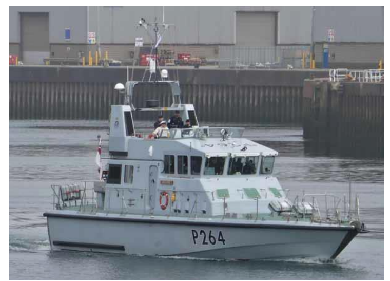
HMS Archer P 264 outbound from Aberdeen