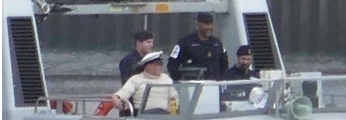
I Like this part of the photo, the crew manning the flying bridge outbound from Aberdeen The Aberdeen URNU operated from 1967 until 2012 before being moved to Edinburgh. In summer 2012, the ship was moved to Rosyth Dockyard to serve with Edinburgh URNU and to increase the presence of the RN in Edinburgh In June 2017, Archer, in company with HM Ships Smiter, Ranger and Exploit, deployed to the Baltic to take part in the NATO BALTOPS exercise, the first time that Royal Navy P2000s have been involved in such an exercise. Archer is permanently

receive an upgrade The Archer class were built as Royal Naval Reserve (RNR) training vessels, but after limited use they were transferred to URNU service. Archer became the training ship of the Aberdeen URNU in 1991, succeeding Chaser . The role of a training ship within an URNU is to provide opportunities for students to receive practical training and gain experience afloat. Archer's programme is generally divided into two durations of training - a weekend or the longer deployments that take place during the university Easter and summer holidays. Deployments in the Easter and summer holidays venture further afield, Archer has visited ports from the Western Isles and east coast of Britain to the Republic of Ireland, the Netherlands, Norway and the Baltic. These longer deployments are often undertaken in company with other ships such as Example and Explorer